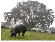
Ibérico pigs Feasting on acorns in the 'dehesa'.